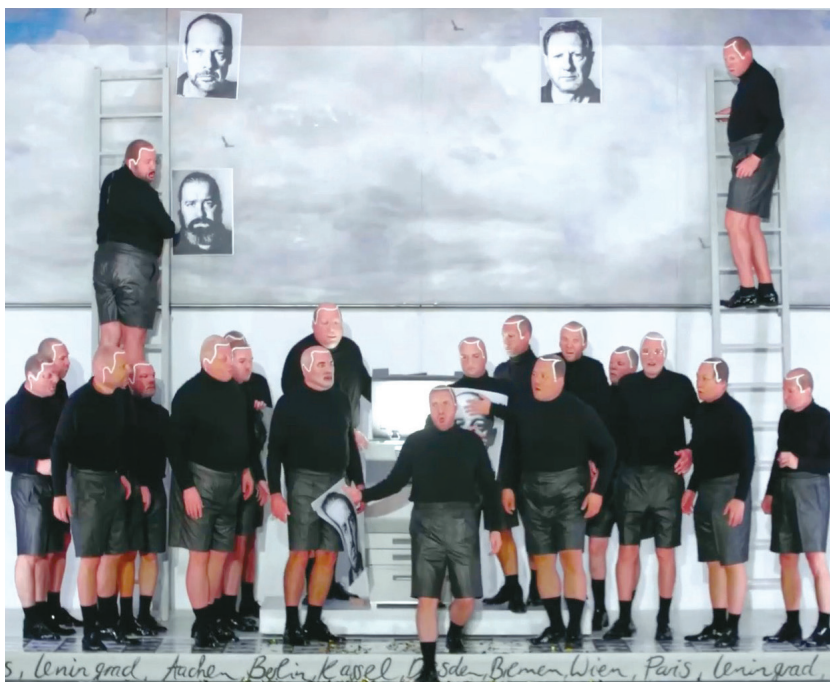
A scene from the Darmstadt performance of Beethoven's Fidelio .

When listening, I often imagined that I was sitting at the controls of a mixer console and turned up the speed. And then I would just assume that Beethoven, when he composed, almost intended to go too far and fast. It's really exulting! It reminds me of children who go crazy with excitement because they don't know how to keep their emotions under control.