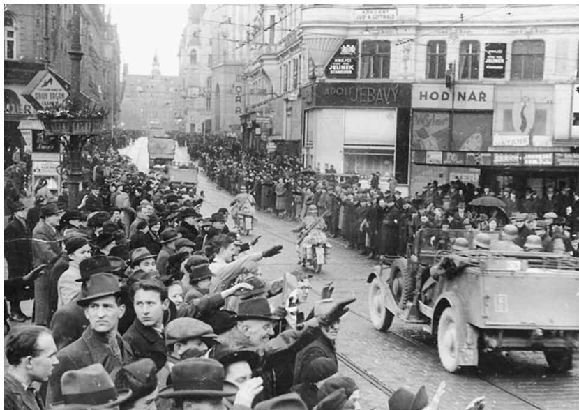
The German Wehrmacht entering Czechoslovakia's capital Brno on March 15, 1939.

and the Baltic States seized by the Red Army in 1944-1945. In doing so, the Russian President reconstructs from the original records what actually happened from 1933 to 1941. He states that those individuals who voted for the EU Resolution are “People who don’t know history. They can’t read or write.”