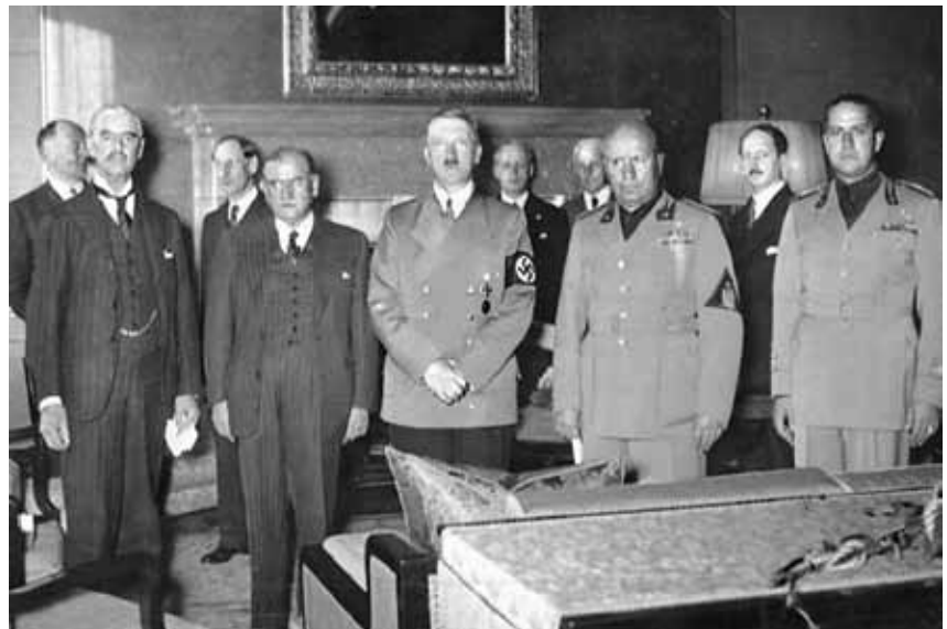
Adolf Hitler and UK Prime Minister Neville Chamberlain in Bad Godesberg, on September 22, 1938.