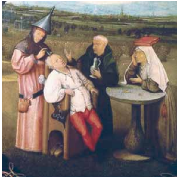
“It is by stimulating the individual’s creative potentialities that neurotic impulses are most efficiently checked.” Extraction of the Stone of Madness by a follower of Hieronymus Bosch or his workshop, 1501-1505.

At the point represented by his late major compositions, notably the string quartets, Beethoven had not only made a revolution in counterpoint, he had expressed thus the discovery of a general principle of musical composition. This example contributed directly to the generation of great composers whose talents were formed during the first half of the 19th century. Schubert, Mendelssohn, Berlioz, Liszt, Brahms, Wagner, Verdi typify the assortment of greater and lesser moons who radiated the sunlight of Beethoven’s genius. These figures, together with the continued reflections of Beethoven, produced the gifted Hugo Wolf, the self-aborted genius of Gustav Mahler from the second half of the 19th century. Then, during the 20th century, the capacity for composing music died, together with the death of poetry and the decay of drama. Although Beethoven’s immediate successors reflected both the direct influence of Beethoven and the favorable circumstances of the spirit of the age of their youth, the genius of Beethoven was not deliberately conceptualized beyond the point represented in particular by the musicologist Schenker. In general, musical theory has misapprehended the essential features of the late Beethoven, with the same included folly exhibited by incompetent learned opinion respecting René Descartes’ notion of universal perfection.