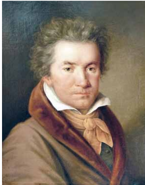
Painting by Willibrord Joseph Mähler, 1815 Ludwig van Beethoven

It is also a fact that the lack of similar disposition among encountered gifted persons correlates with a characteristic sour note in their internal mental discipline, a certain shallowness. A person who enjoys "rock" or prefers romantic "kitsch" is invariably a moral mediocrity under closer scrutiny. Romantic musical "kitsch" belongs to the department of the bellylaughs after the third or fourth beer, the second bottle of wine. Such moments occur in the life of the creative person, but they occur as "other moments." The person who lacks the habit of great art, the habit of profound excitement in the experience and contemplation of great art, is a deprived, diminished person. Opposite to such deprivation and self-deprivation, knowledge of