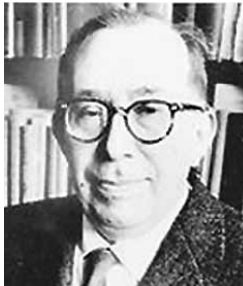
Leo Strauss, protégé of Nazi jurist Carl Schmitt, and professor of political science at the University of Chicago (1949-69).

The students of Leo Strauss compose a gallery of neocon fanatics who gave us perpetual