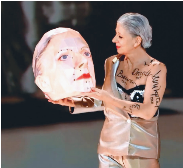
Portrayal of Leonora in the Darmstadt performance of Fidelio .

sense, of a historical event, namely the liberation of the hero of the American Revolution, the Marquis de Lafayette, the French Republican, by his wife Adrienne. This reflects Beethoven's own republican sentiments, which included at that time of feudal structures and Napoleonic campaigns, both personal courage and the desire for freedom.