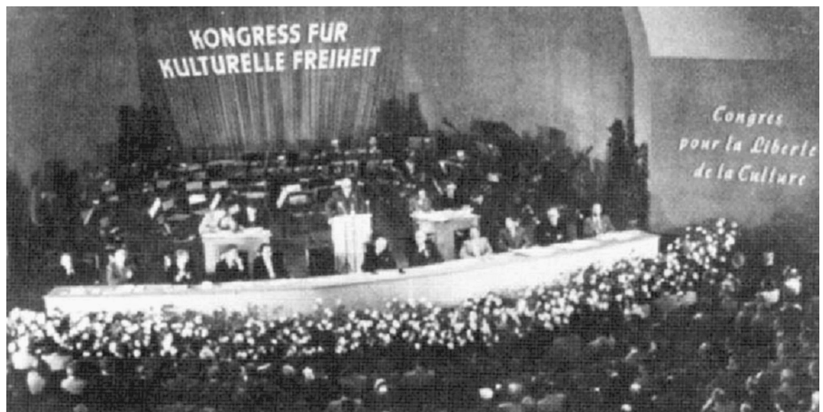
The first Congress for Cultural Freedom convention, Berlin, 1950.

In contrast, the National Socialists' image of man, with its blood-and-soil ideology, is based on a racist, chauvinistic, and Social Darwinist conception of the superiority of the "Aryan" race. To claim that because both the classics and National Socialism occurred in Germany, there is an inner connection between these dia-