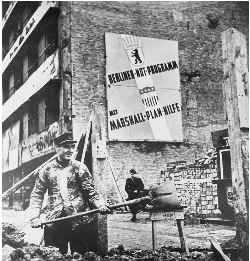
U.S. National Archives

But beyond this partisan political point of view [it was about the campaign strategy for 1957—A.A.], there is no conceivable policy for a pro-