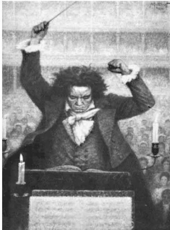
Painting by Michel (Mincho) Katzaroff Ludwig van Beethoven

language. The relationship of language to the individual’s consciousness-in-general, the individual’s conscious and preconscious notions of social identity, makes music the most social of the art forms. Within music generally, song and opera have the advantage of immediately subsuming drama and poetry. Song is the