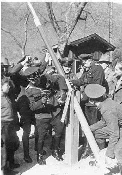
German and Austrian border police dismantling a border barrier on March 15, 1938.

In his speech to the CIS conference, President Putin begins by referencing that anti-Russian EU Resolution. He states that the Resolution prompted him to learn the truth of the matter. He says: