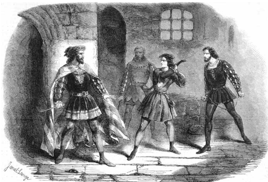
Illustration by Ange Louis Janet, 1860

One might say of the cinema and TV screen that, unfortunately, the medium has tended to become the message. The fact that singers can perform fellatio on a microphone before thousands of cheering spectators has apotheosized heartburn into a salable product. The